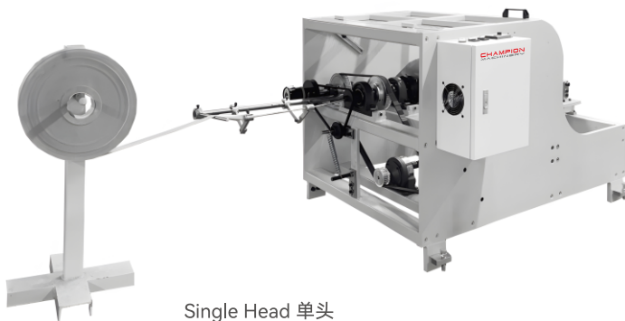
Single Head 单头