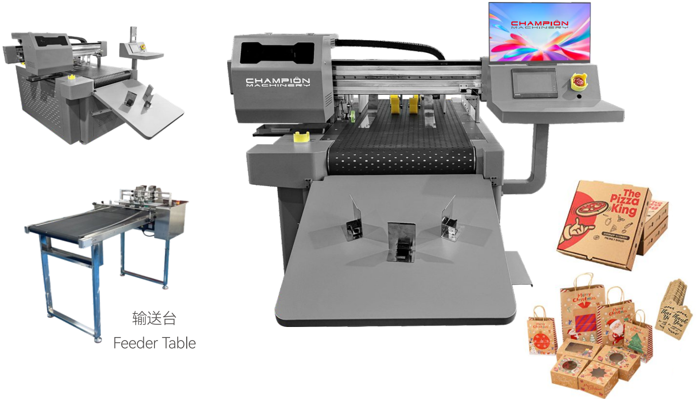
输送台 Feeder Table