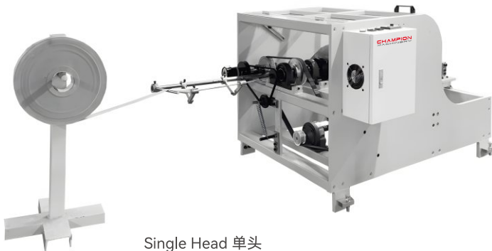
Single Head 单头

Add: 42#2and Longyan Industrial Avenue, Humen Town Dongguan City, China PR